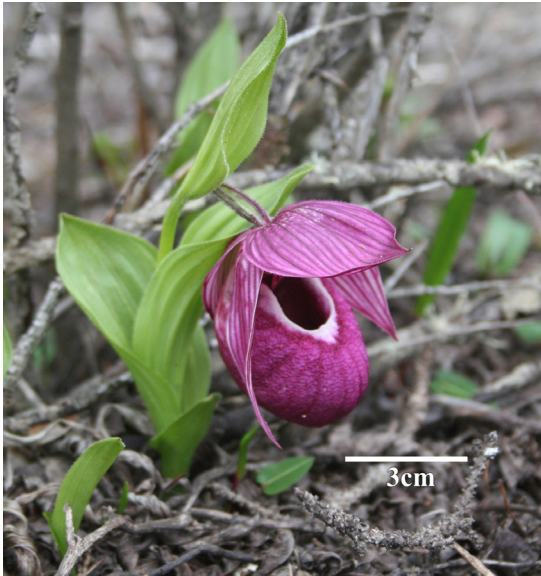
FIGURE 1. Cypripedium tibeticum flowers in China's Sichuan Province in China are pollinated by queen bumblebees searching for nest sites (Li et al. 2006). The dark entrance of the lip and the position of the flower near the ground are thought to mimic a mouse hole, a common nest site. The queen enters the lip, becomes trapped, and escapes by squeezing beneath the stigma and then an anther at one the lateral openings at the junction of the bases of the lip and petals, delivering and removing pollen in the process. This trap-lip pollination mechanism occurs in all slipper orchids. Most Cypripedium species are pollinated by bees but diverse types of flies have recently been found to be the pollinators of small-flowered species.

belonging to diverse species (Edens-Meier et al. , in press), a characteristic that facilitates their attraction and entrapment. Eight Cypripedium species are pollinated by small bees belonging to different bee families. The most important bee family is Halictidae (sweat bees), followed by the Andrenidae (mining bees). A few bee species of minor importance belong to the Megachilidae (leaf-cutter bees), Colletidae (plaster bees), and Apidae (varied bees including bumblebees and honeybees). It is notable that honeybee pollination has been detected in only a single species of Cypripedioideae , the North American C. reginae , which has diverse pollinators; honeybees are not native to North America. Bees in Halictidae and Andrenidae are the sole pollinators of some Cypripedium orchids. The halictid pollinators belong to four genera with Lasioglossum species being